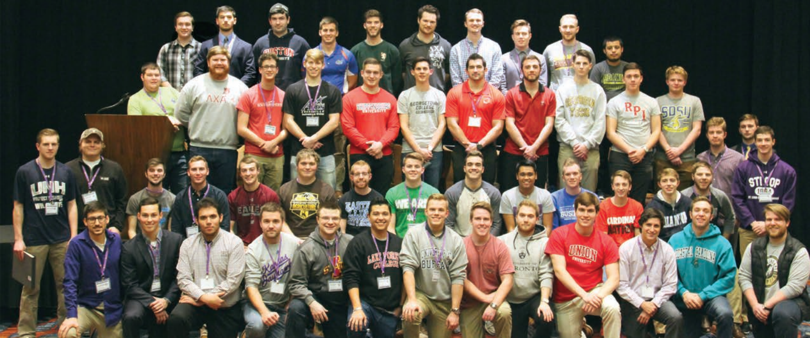
High Alpha Summit attendees

BROTHER BY BROTHER THEIR FUTURE. YOUR IMPACT.